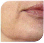
LOOSE AND SAGGING SKIN

THIS TREATMENT IS SO VERSATILE THAT IT CAN BE USED TO TARGET A NUMBER OF CONCERNS ON BOTH THE FACE AND BODY INCLUDING: