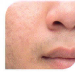
PITTED SKIN/ SKIN TEXTURE