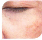
SUN DAMAGE/ PIGMENTATION