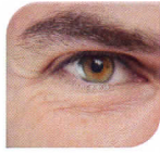
FINE LINES AND WRINKLES